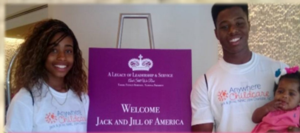
Local children at National Conference in Charlotte.