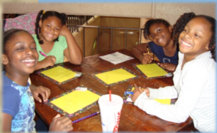
Writing letters to vets for Christmas

Hosted Central Region Area Workday Cluster