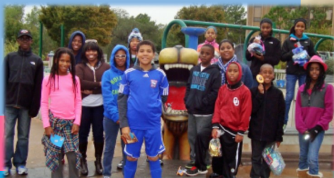
Mission Zoopossible: Zoo Scavenger Hunt